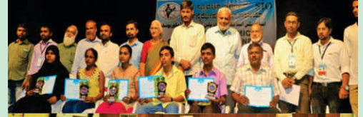
SIO Tumkuru (Karnataka) organised a felicitation ceremony for SSLC & +2 toppers at Tumkuru