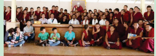
SIO Madikeri participated in the Interfaith Dialogue at World famous Tibetan Golden Temple, Kushalnagar