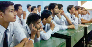
SIO Malerkotla, Punjab organised a Carreer Guidance Lecture for students of 11th and 12th Standard