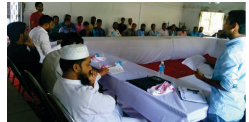
Shiksha Samvad - Assam

brought in sight of many issues, especially related to semantic manipulation of terminologies by distorting its historic context. The journalists also were briefed with the ongoing “Shiksha Samwad” and “Sansad Mein Shiksha” to make the stories on trends of people demands for educational policy. Issues of distorting history and falsification of the text were also part of the discussion. The session then followed by dinner.