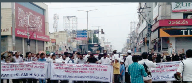
SIO - A. P organised a protest in Vijayawada for Special status of Andhra Pradesh