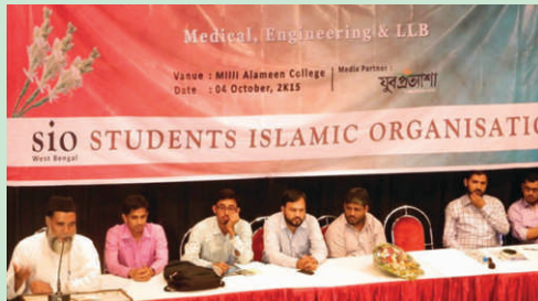
SIO felicitated 200 students at West Bengal