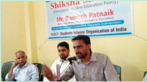
Withdraw the offer of WTO: Shiksha Samvad at Vijayawada