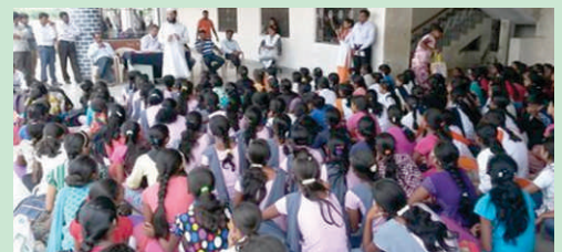
Exceed for Excellence - Campaign by SIO Maharashtra North