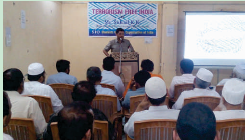
"Terrorism Free India" campaign at Delhi