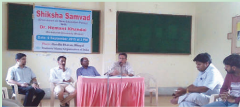
SIO BHOPAL organised Shiksha Samvad at Gandhi Bhavan