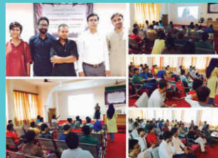
University film Club in collaboration with SIO AMU and Aligarh Activists Society organised a seminar on "The Impact of Politics in Film Making" at AMU.