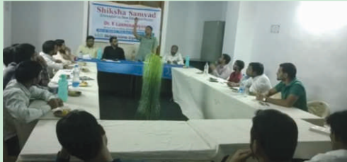
Shiksha Samvad at Hyderabad -Choice Based Credit System: Anti poor