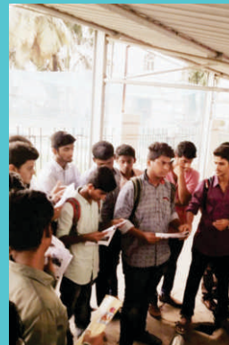
SIO Weekly College meeting at Tamilnadu