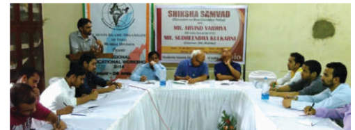
Shiksha Samvad at Mumbai