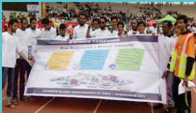
"Run Responsibly | Browse Ethically" by SIO Hyderabad