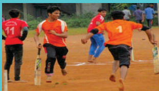
SIO Thalikulam IC